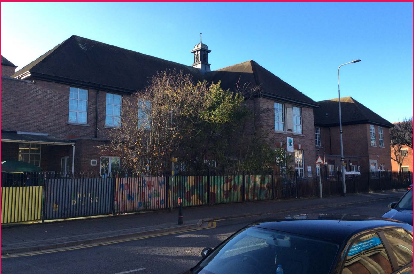
Ysgol Mynydd Bychan

In summary, when taking into account the expected uplift, it is expected that there will be few surplus places at entry to Reception Year in 2020/21 and an overall projected surplus of between 12% and 14% in the years that follow, in Welsh-medium community primary schools across the combined catchment areas of Ysgol Mynydd Bychan, Ysgol Glan Ceubal, Ysgol Gymraeg Melin Gruffydd and Ysgol Y Wern.