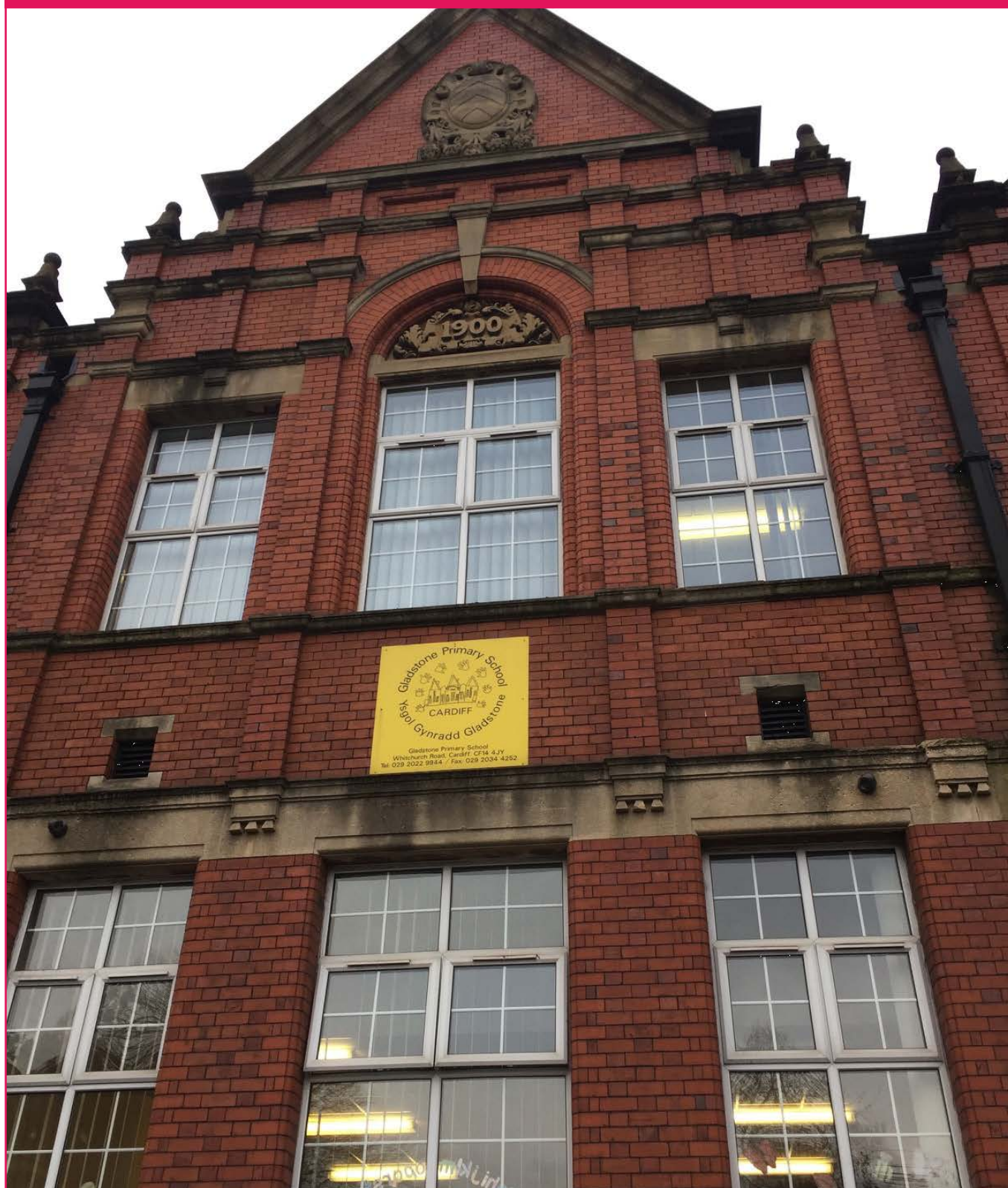
Gladstone Primary School

Any building work carried out on the Allensbank Primary School site would be managed effectively in consultation with the school to ensure the full curriculum continues to be delivered and that high education standards and safety standards are maintained.