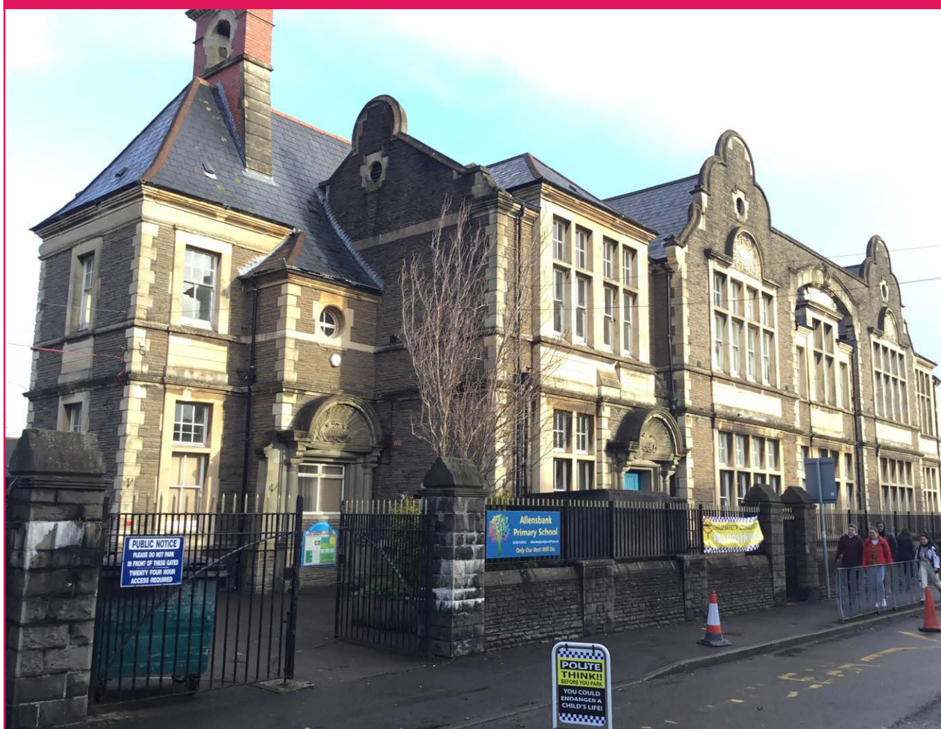
Allensbank Primary School

If admission numbers and surplus places were calculated on the basis of capacities of 420, 360 and 270 places respectively as outlined on page 13, surplus places in the three English-medium community schools would increase to approximately 35% of capacity.